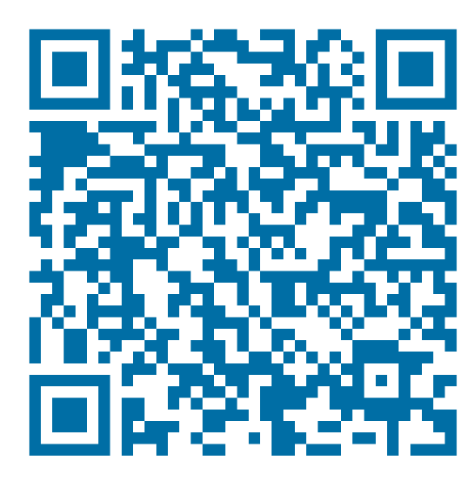
Presentations / recording (available by end of today) https://t.ly/-4nl1