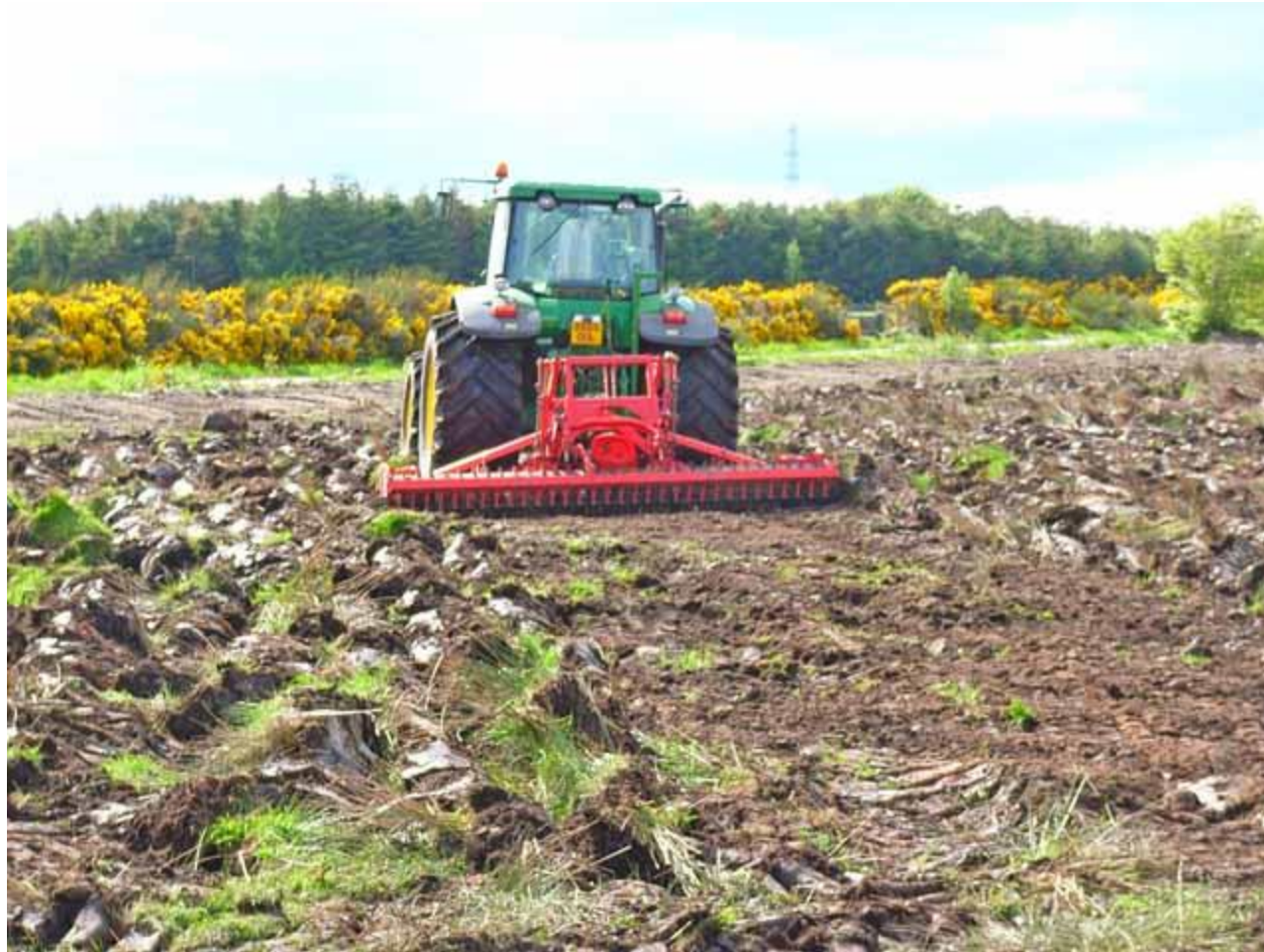
O. Dixon, 2006, [Clearing the land at Nether Muirskie – geograph.org.uk 178360.jpg).jpg][Photograph], https://commons.wikimedia.org/wiki/File:Clearing_the_land_at_Nether_Muirskie_-_geograph.org.uk_-_178360.jpg , CC-BY-SA-4.0.