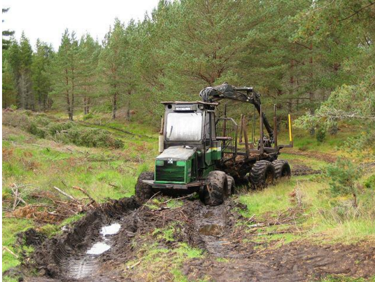
L. Burke, 2007, [Tractor in the mud – geograph.org.uk - 578481 .jpg].jpg][Photograph], https://commons.wikimedia.org/wiki/File:Tractor_in_the_mud_-_geograph.org.uk_-_578481.jpg , CC-BY-SA-2.0.