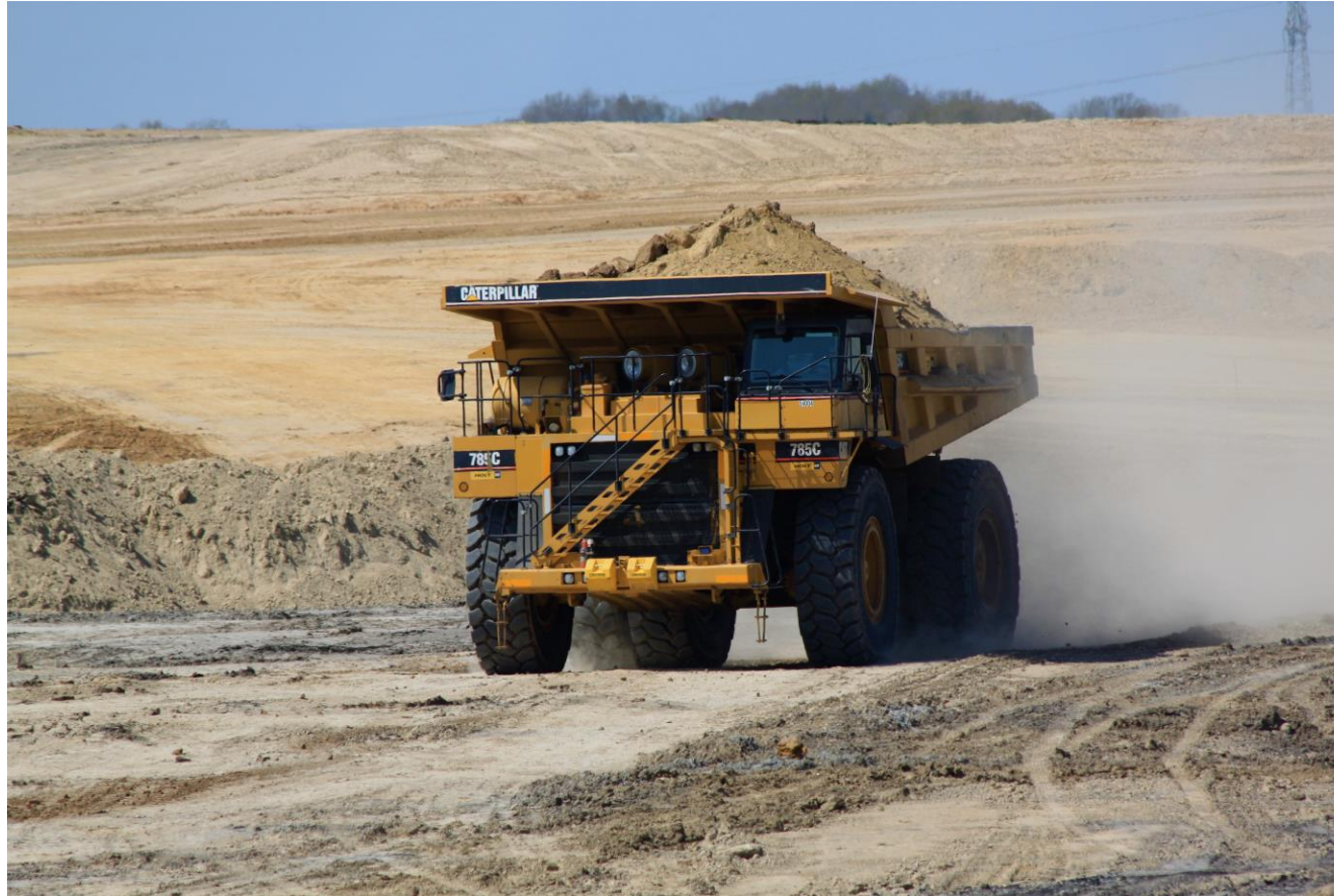
[Caterpillar haul truck, Luminant Energy Kosse lignite mine][Photograph]