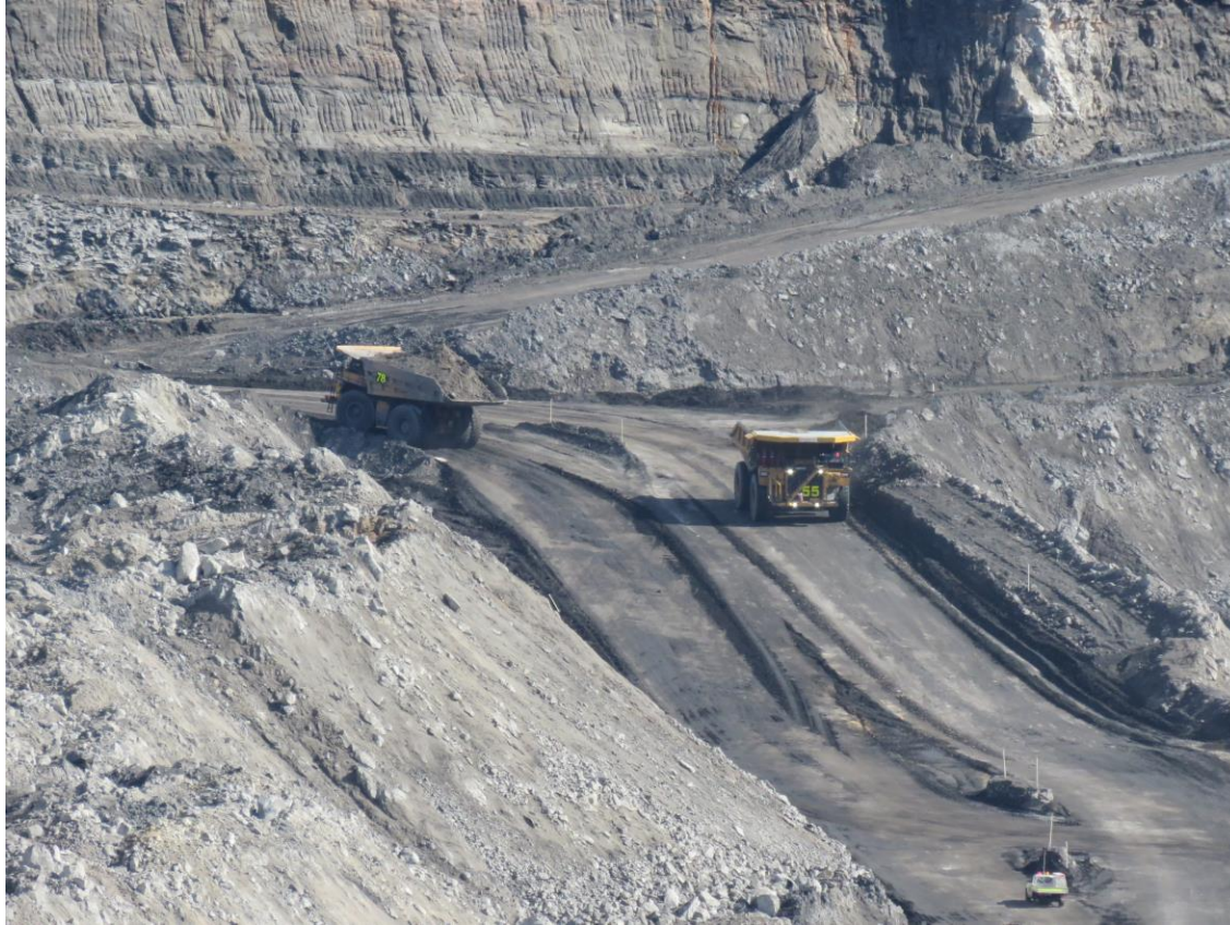
Calistemon, 2022,[The Premier coal mine, Collie, April_2022_16.jpg][Photograph], https://commons.wikimedia.org/wiki/File:Premier_coal_mine,_Collie,_April_2022_16.jpg , CC-BY-SA-4.0.