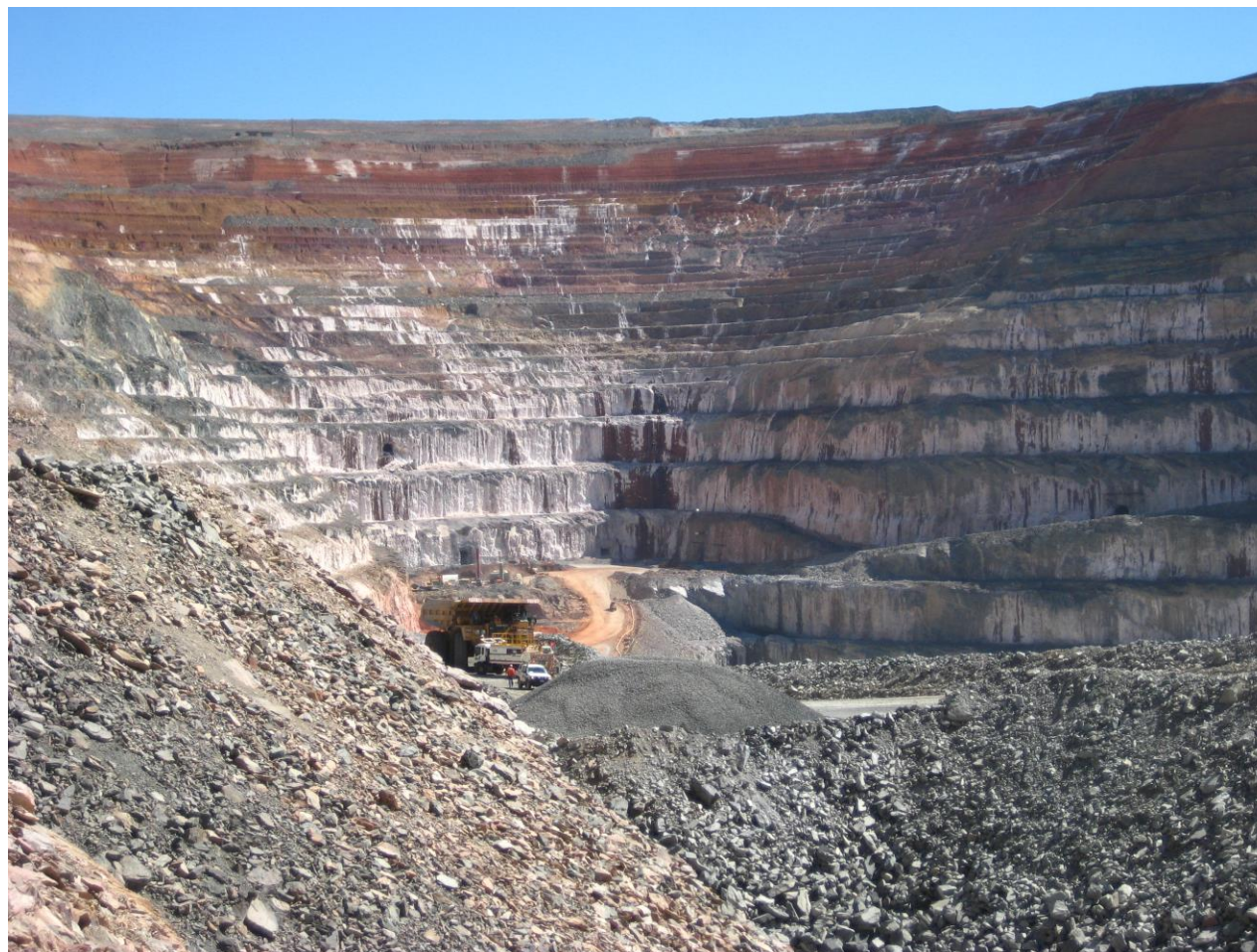
Calistemon, 2009,[Sunrise Dam Gold Mine open pit 06.jpg][Photograph], https://commons.wikimedia.org/wiki/File:Sunrise_Dam_Gold_Mine_open_pit_06.jpg , CC-BY-SA-4.0.