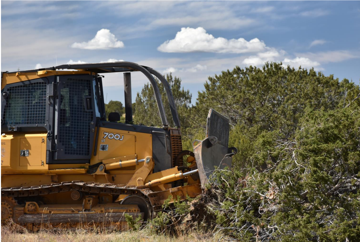
Kaibab National Forest, 2019,[Grassland Restoration 2019(4886791186).jpg][Photograph], https://commons.wikimedia.org/wiki/File:Grassland_Restoration_2019_(48867911186).jpg , CC-BY-SA-4.0.