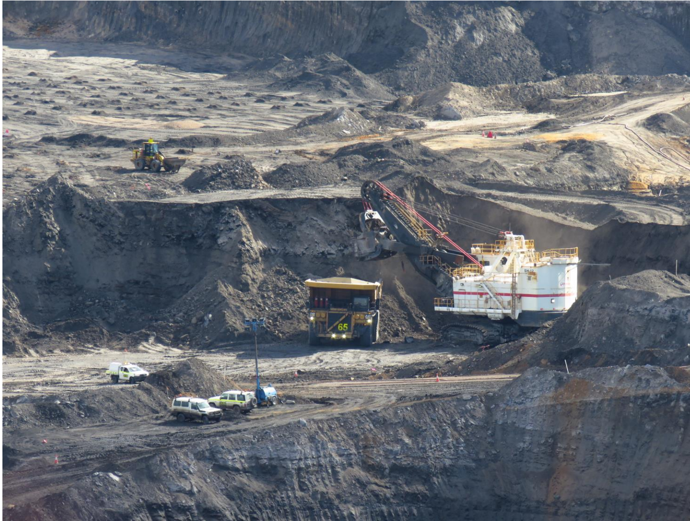
Calistemon, 2022,[Premier coal mine, Collie, April_2022_20.jpg][Photograph], https://commons.wikimedia.org/wiki/File:Premier_coal_mine,_Collie,_April_2022_20.jpg , CC-BY-SA-4.0.